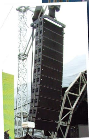
L-Acoustics' line array was on the main stage

Hosting everyone from hip hop originators The Sugar Hill Gang to the saturated pop tunes of Alphabeat, Manchester's